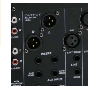
All connectors are on the rear panel out of the way