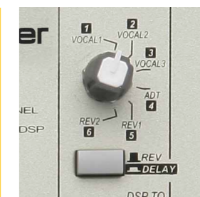
12 of the best high quality effects