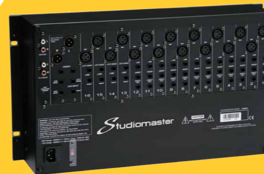
162BPX Rear Panel - All the inputs and outputs you could possibly need.

The 162BPX is housed in a steel, 6 space rack mounting chassis with all controls, including the power switch, on the front panel and all input/output connections securely positioned on the rear panel - out of harms way! Individual circuit boards are used throughout and all controls are actually bolted to the front panel making the 162BPX a tough, reliable and easy to service mixer.