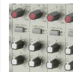
4 combination mic/stereo channels - put simply... you can plug more in!