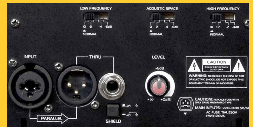
M5B/M6B/M8B Rear Panel

Their design ensures you critical monitoring of your mixes, through expert development from the speaker cones to the baffle moulding, providing optimal dispersion. The mdf internally braced cabinets are exceptionally ridged giving vibration free performance. The rubber surround, sandwich constructed cones produce a smooth frequency response whilst the titanium diaphragm tweeter is fluid cooled for long term reliability. All full range models are bi-amplified with contour switches to help match room acoustics and the balanced input provides noise free connection.