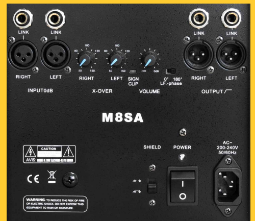
M8SA Rear Panel