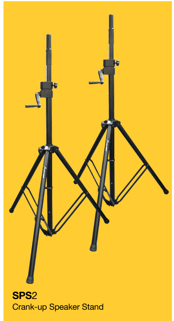
SPS2 Crank-up Speaker Stand