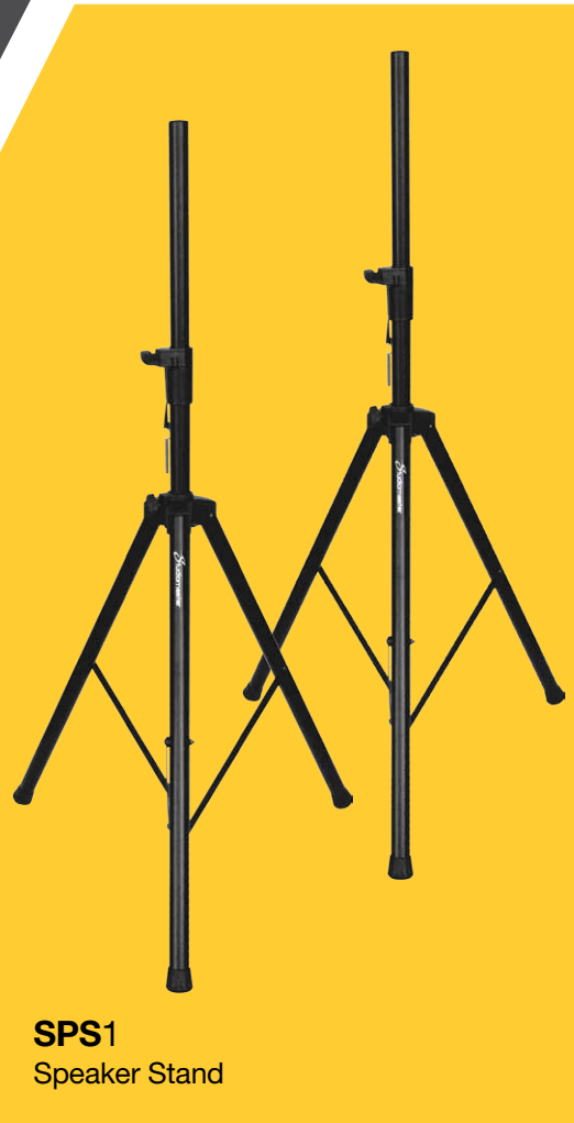
SPS1 Speaker Stand