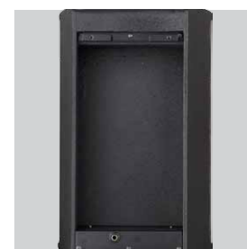
Storage for cables