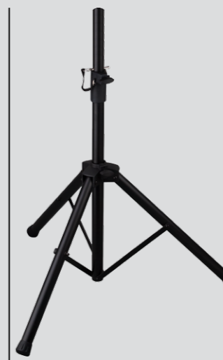
SPS3 Speaker stands (both models)