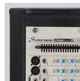
Detachable powered mixer