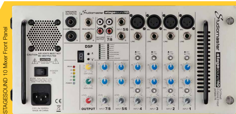
STAGESOUND 10 Mixer Front Panel

The Stagesound range of easy to use, high quality PA systems sets a new standard in easy to use portable sound.