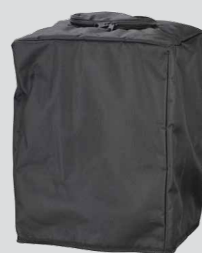
Cover 8SS 2 x Speaker covers (Stagesound 8)