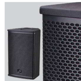
Two full range speakers

Includes all the features of the Stagesound 8 but with more input channels and more power. A total of 8 inputs, 4 mic/line and 2 stereo, and an impressive output power of 120 Watts per channel. The full range speakers feature 10" bass drivers.