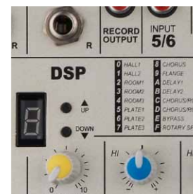
High quality DSP effects