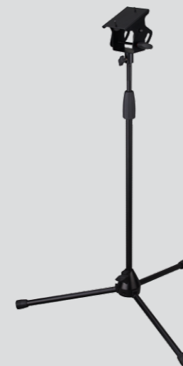
MXS1 Powered mixer stand (both models)